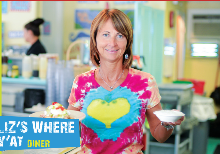
LIZ'S WHERE Y'AT DINER

St. Tammany Parish offers scenic beauty and memory-making experiences, and is within an hour of New Orleans, Baton Rouge and the Mississippi Gulf Coast. You'll find picturesque green spaces, a diverse culinary scene, an eclectic collection of galleries and boutiques, one-of-a-kind attractions and festivals all year long. Explore the Northshore through the personalities of each charming town.